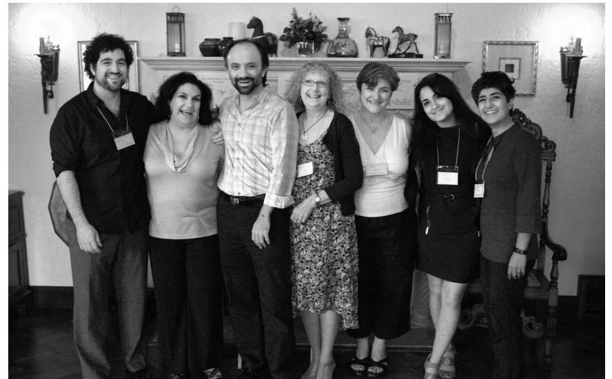
Golden Thread Productions Board of Trustees 2011