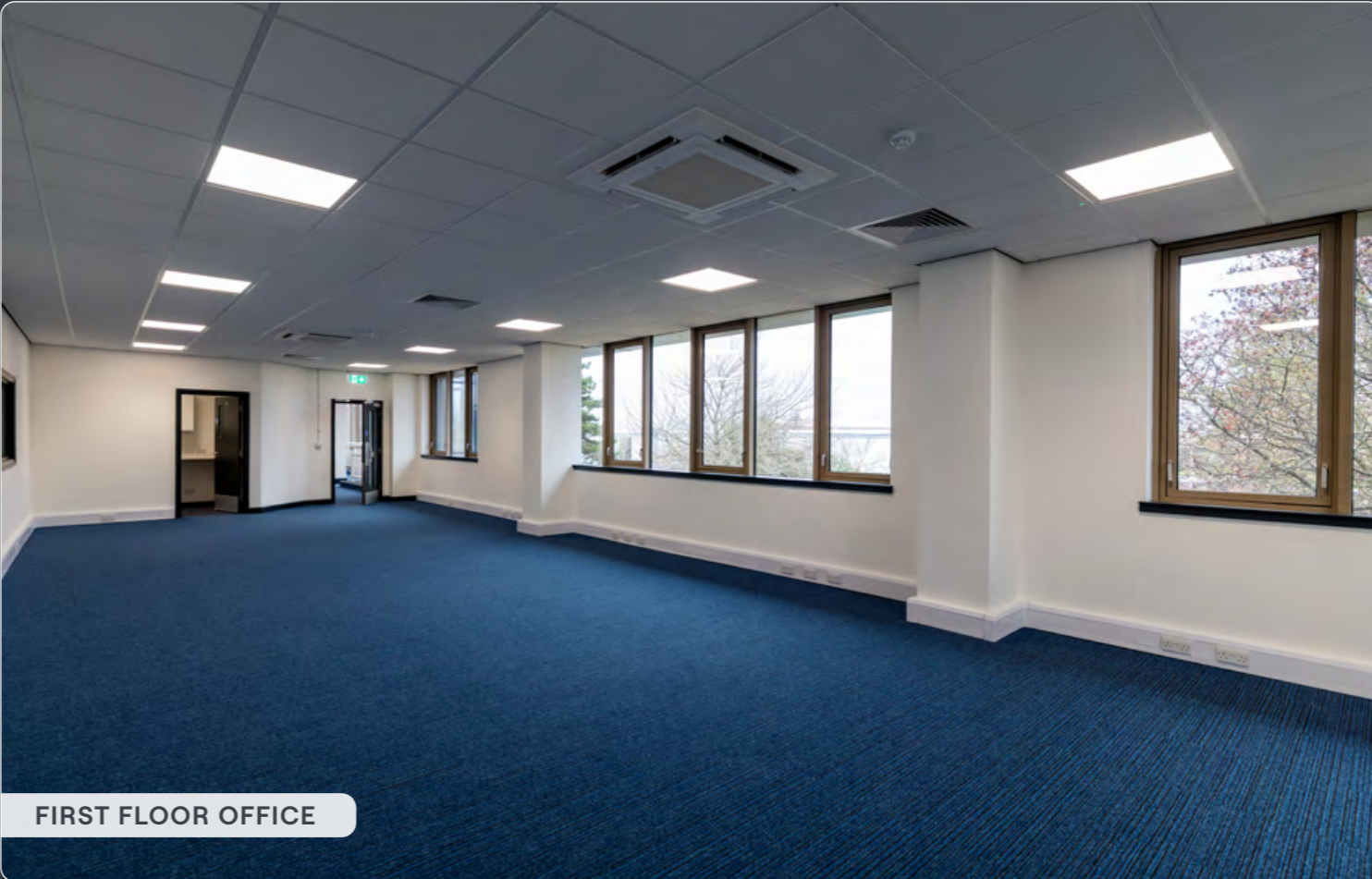
FIRST FLOOR OFFICE