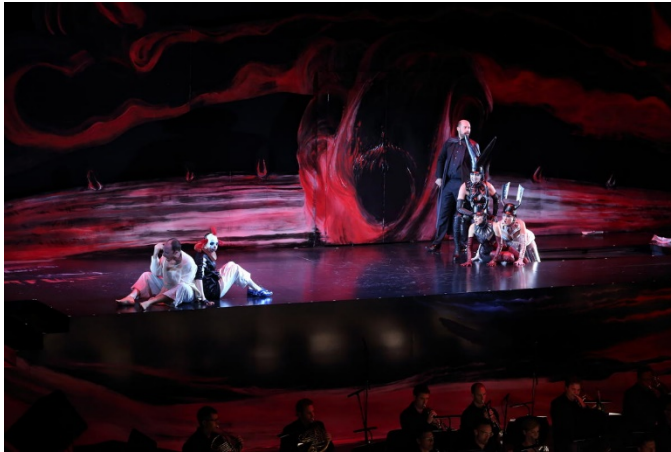
From the LA Phil-commissioned Louis Andriessen work Theatre of the World conducted by Reinbert de Leeuw with an ambitious multimedia component from the Quay Brothers.

For each of the last fourteen years, the generous support of donors has allowed the Los Angeles Philharmonic Association to maintain a balanced budget, while also growing our audience to more than one million each year, reaching 150,000 children and families through our educational initiatives, and stewarding our two iconic venues: Walt Disney Concert Hall and the Hollywood Bowl.