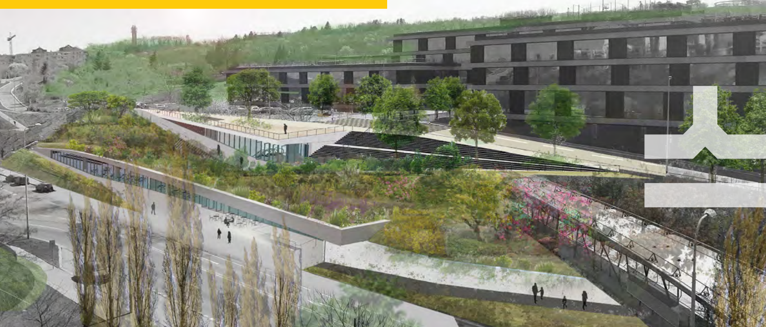
HOSPITAL PAVILION, Jilemnice 02/2025 - 12/2026