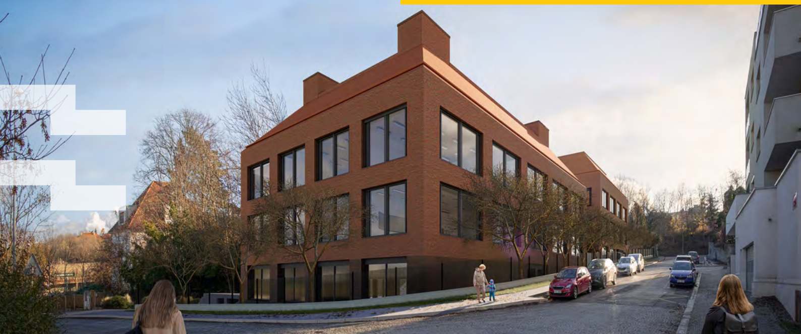
MULTIFUNCTIONAL COMPLEX, Brno 09/2025 - 09/2027