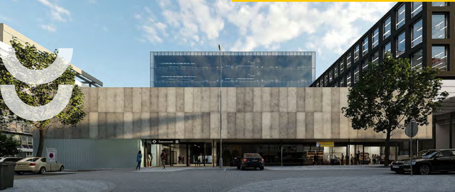
F. X. ŠALDA GYMNASIUM, Liberec 05/2025 - 09/2026