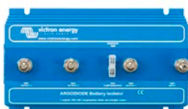
Argo Diode Isolator 140-3AC

Diode battery isolators allow simultaneous charging of two or more batteries from one alternator, without connecting the batteries together. Discharging the accessory battery for example will not result in also discharging the starter battery.