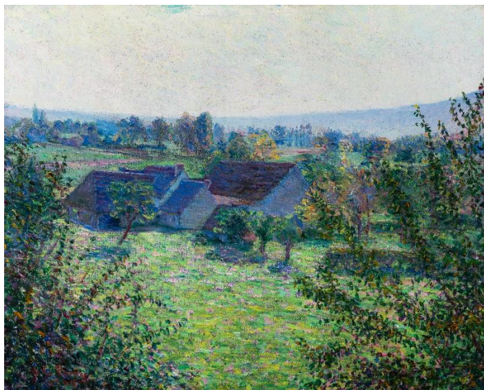
Lilla Cabot Perry (1848–1933) Old Farm, Giverny , 1900 Oil on canvas San Antonio Museum of Art Purchased with funds provided by the Lillie and Roy Cullen Endowment Fund