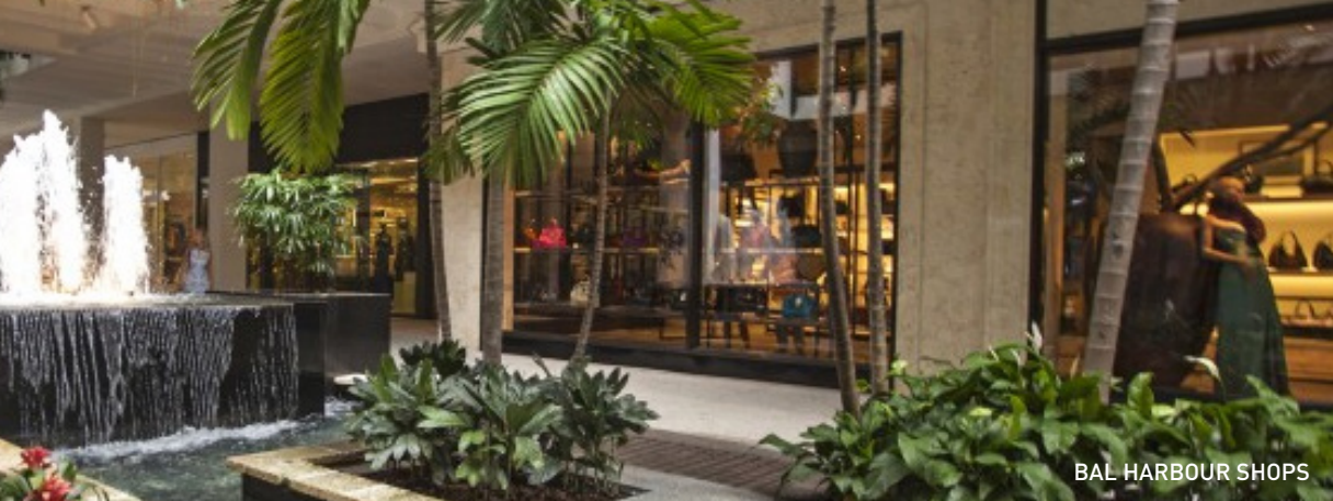
BAL HARBOUR SHOPS