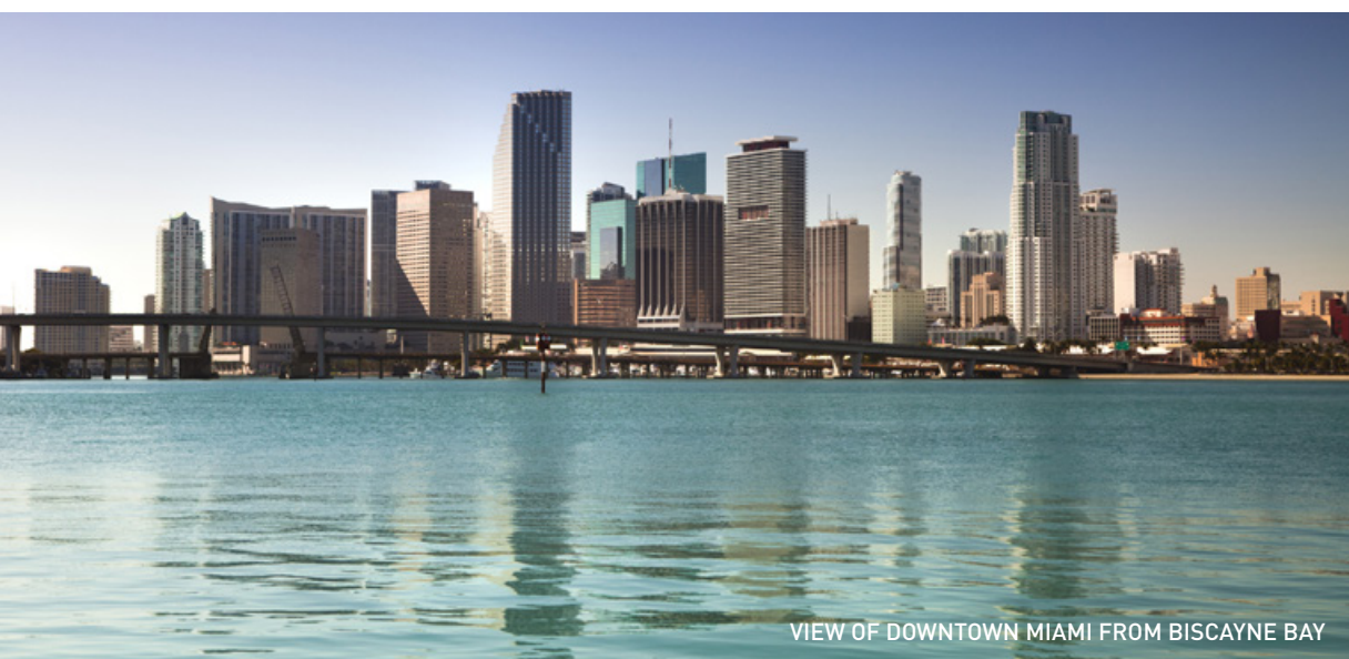
VIEW OF DOWNTOWN MIAMI FROM BISCAINE BAY