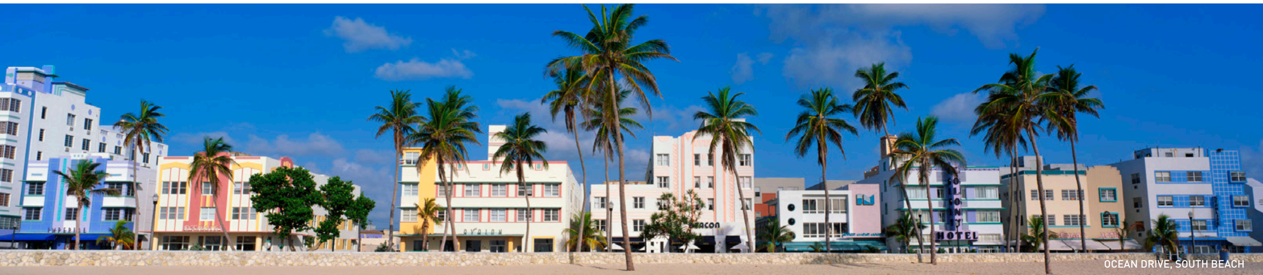
OCEAN DRIVE, SOUTH BEACH

The other facet of life at IRIS is the great dining and entertainment found right in your neighborhood. Delight in world cuisines at Rouge with its French and Moroccan menu; or Tamarind Thai's Asian delicacies; La Vacas Gordas savory Argentinian steaks, or the Peruvian-influenced K'Chapas... all steps from your front door. Looking for something more casual? Pizza, pasta, Colombian treats, seafood, sandwiches, and more are all a short stroll away. In the evenings, enjoy sophisticated lounges and bars in North Beach, or head a few minutes north to Bal Harbour, south to South Beach, or west to Downtown Miami and Brickell. You're connected to it all.