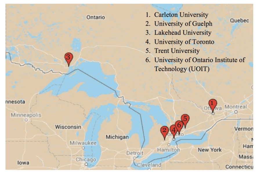
Figure 1 . Map of the six universities studied.

In Ontario, a university's academic calendar is updated annually and lists all courses currently offered by a university, providing an approximately 50-word description of each. A keyword search and scan was performed on undergraduate and graduate academic calendars from six Ontario universities, between April and September 2014. These six universities represent 30% of the 20 Ontario universities and 6.1% of Canadian universities (Ontario Universities' Application Centre, 2015). The universities were Carleton, Lakehead, Guelph, Toronto, Trent, and Ontario Institute of Technology. They were selected to provide a representative sample based on geographic range, size (student enrolment), and diversity of program offerings. The universities are distributed in western, central, and eastern regions of the province (Figure 1), although most are within the boundaries of southern Ontario, due to the concentrated human population in this area. We also included Lakehead in the sample to maximize geographic range because its main campus is the most northerly university in the province.