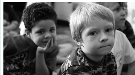
Elwood educators are documenting students' progress in full-day kindergarten.