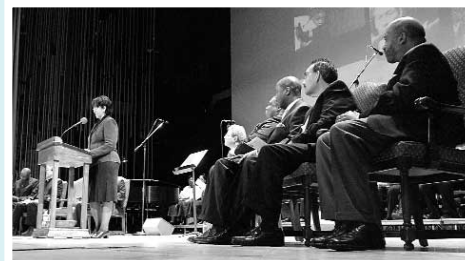
The community gathers to mark Martin Luther King Jr. Day at the Paramount