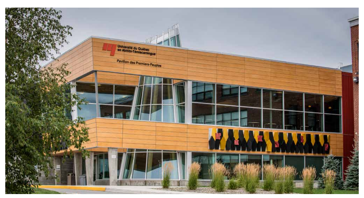
Université du Québec en Abitibi-Témiscamingue's Pavillon des Premièrs Peuples

At l'Université du Québec en Abitibi-Témiscamingue, programs are not just one-way: The university's Projet Piwaseha educates the general population by offering sensitivity training to people of the region on the realities of Aboriginal life and culture.<sup>18</sup>