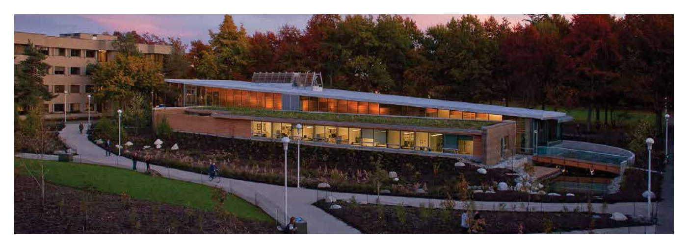
University of Victoria's First Peoples House