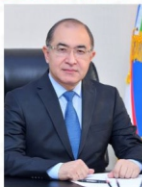
Dear WAKO Family,

I have the honor to invite all members of the WAKO family to an international tournament that will be held from June 29 to July 3, 2022 in the capital of the Republic of Uzbekistan, in the city of Tashkent. Kickboxing tournament "UZBEKISTAN OPEN" is the next international level tournament under the auspices of WAKO, which is held in the Central Asian kickboxing "UZBEKISTAN OPEN-2". Competitions will be held in the modern sports complex "UZBEKISTAN", where we have prepared 3 rings and 6 tatami. created a platform where the best athletes from all over the world will meet, compete with each other and gain the necessary experience. We will be glad to see you all at our site of the UZBEKISTAN OPEN-2 tournament in the capital of one of the most hospitable countries in the world - Uzbekistan