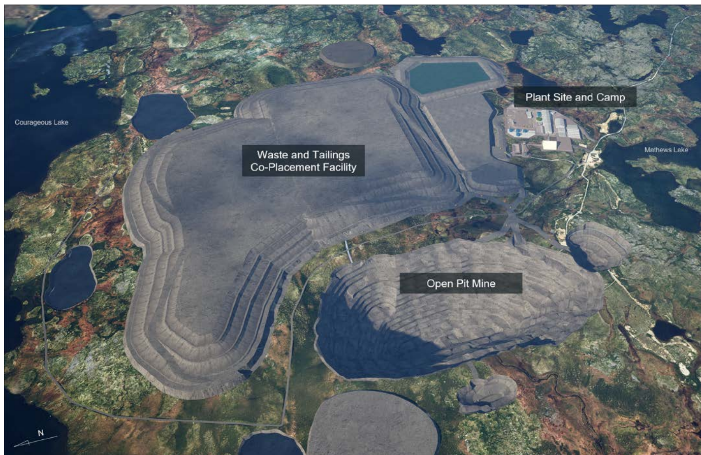
Figure 2- 2024 PFS Layout

The 2024 PFS mine plan uses an open pit truck and shovel operation. Mill feed is processed onsite by crushing, grinding and flotation. Flotation concentrate is pressure oxidized and cyanide leached to produce a gold doré. Waste rock will be generated during the mining of economical ore and will be directly hauled to the co-placement storage facility (CPSF) along with flotation tailings. Flotation tailings will be co-placed with waste rock while neutralized leach tailings will be placed in a separate facility. The 2024 PFS layout is shown in Figure 2.