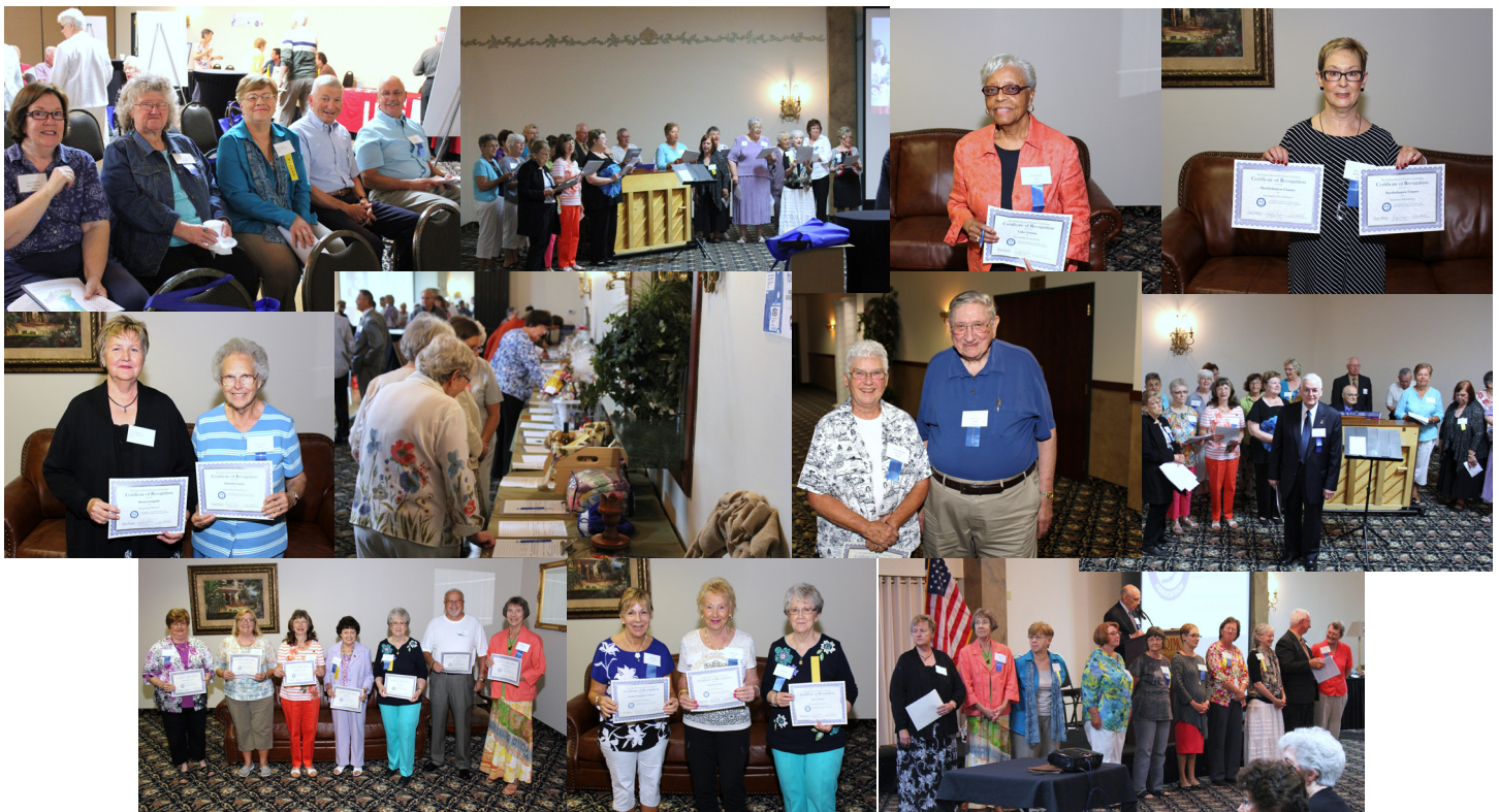
The Indiana Retired Teachers Association held their annual Representative Assembly on June 17, 2015. It was well attended and enjoyed by all.